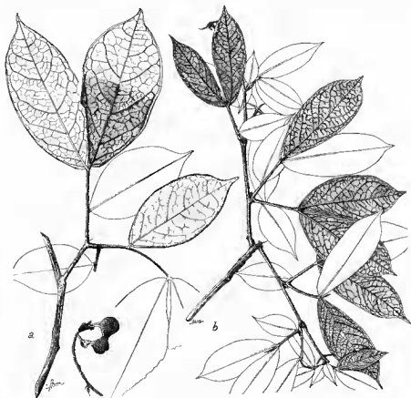
Pl. 2. — Abarema muricarpa Kosterm. : a, holotype; b, Brass 25547 (BO).

Also close to A. gunnanense Kosterm. but the glands and the corolla tube different.